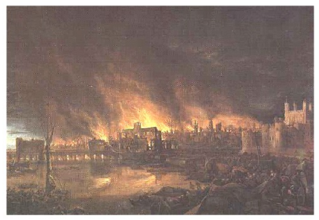
The Great Fire of London also took place on the 11th of September, 1666, when allowance is made for the change of calendar.

Rev. 9:11 "And they had a king over them, which is the angel of the bottomless pit, whose name in the Hebrew tongue is Abaddon, but in the Greek tongue is Apollyon (That is to say destroyer)."