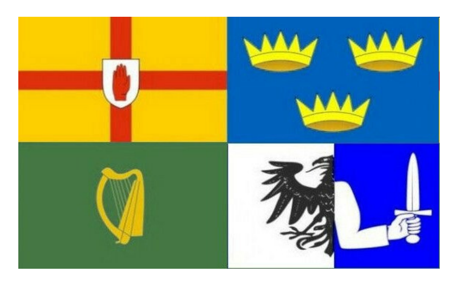
Ireland Four Provinces Flag