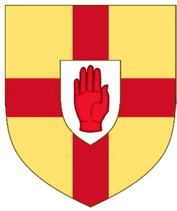
Arms of Ulster