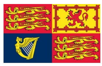
Royal Standard of The United Kingdom