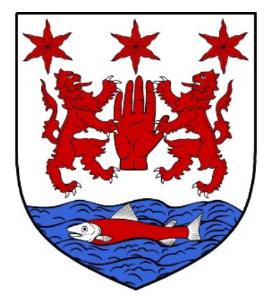
Arms of Neill - Ireland