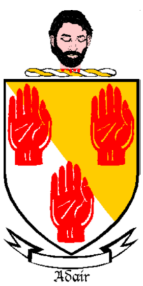
Arms of Adair Ireland