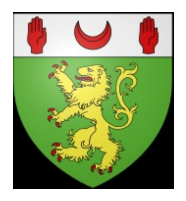
Arms of MacCartan