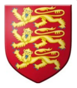
Arms of England