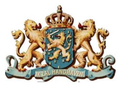
The Arms of The Kingdom of The Netherlands