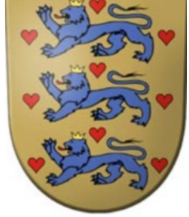
Arms of Denmark