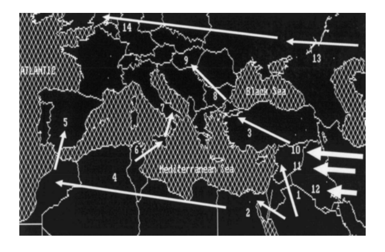
Figure 3: Arab-Turk Invasions