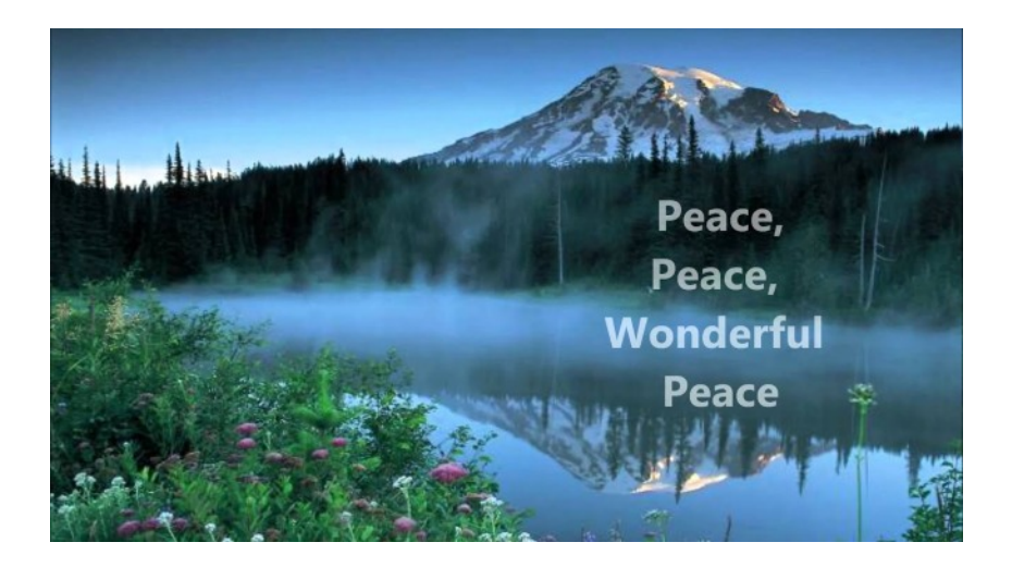
Tape No 166 By Ella Rose Mast Oct. 1994