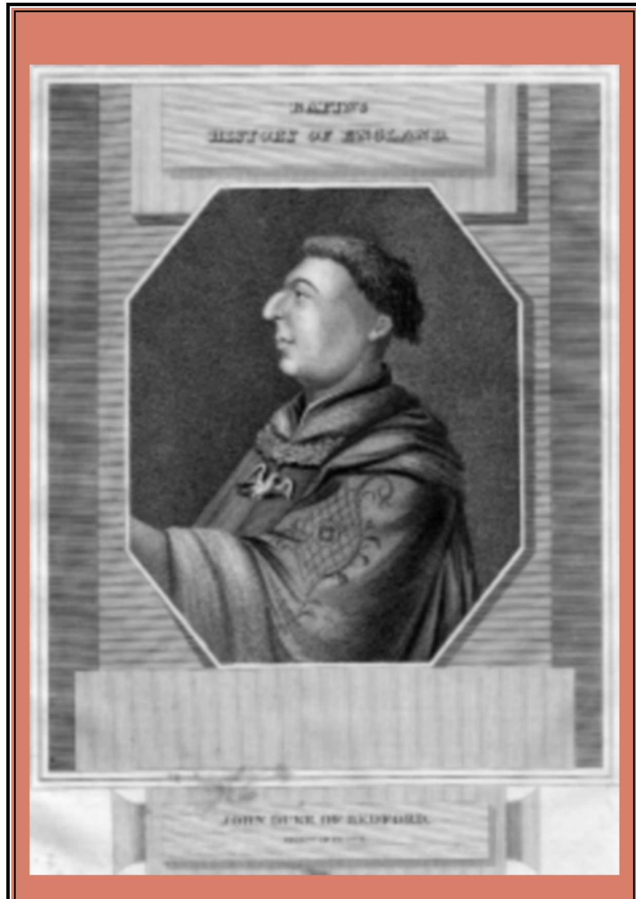
The Duke of Bedford Regent of France