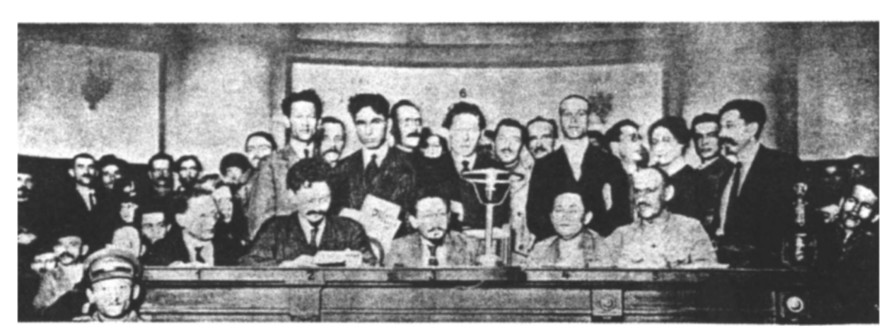
An interesting meeting of the Soviet Leaders (a very rare photo; in Russia its possession is punished with death)

I. Moses Uritzky (who was killed by a bomb in Petrograd: note the heads to the right and left of him; — see page 15). 2. Leiba Trotzky-Braunstein (see page 2). 3. Swerdlow (see page 19). 4. Sinowjeff-Apfelbaum (see page 1). 5. Feyermann. 6. Comrade Michael. from the Bolshevist 'Seminary at Capri