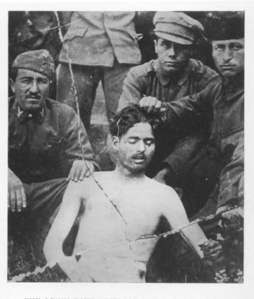
THE LENIN BOYS POSE FOR THEIR PHOTOGRAPH WITH THEIR VICTIM.