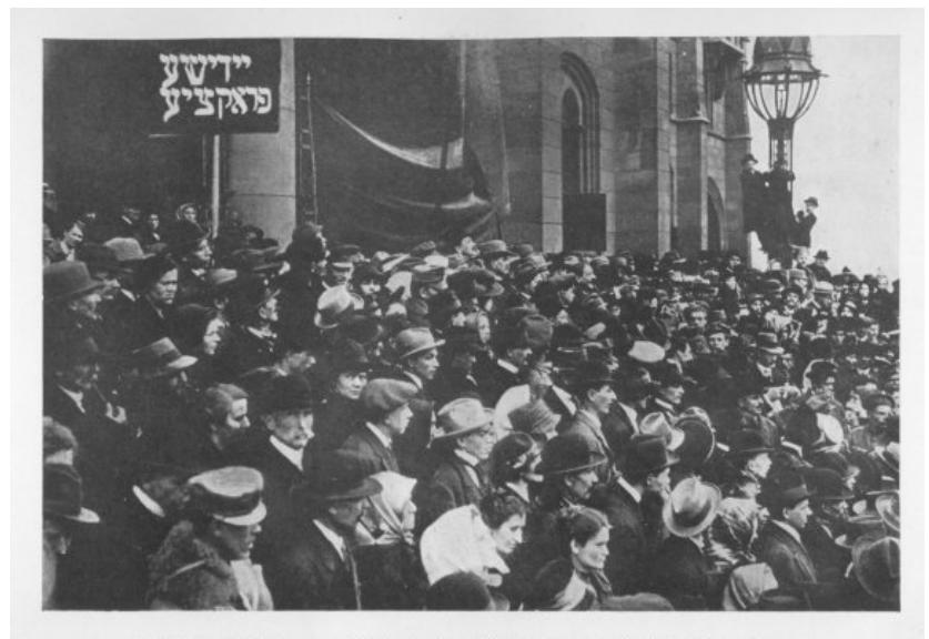
THE JEWS CALL A MEETING AND DECIDE TO ORGANISE A JEWISH RED REGIMENT TO FIGHT FOR BOLSHEVISM.