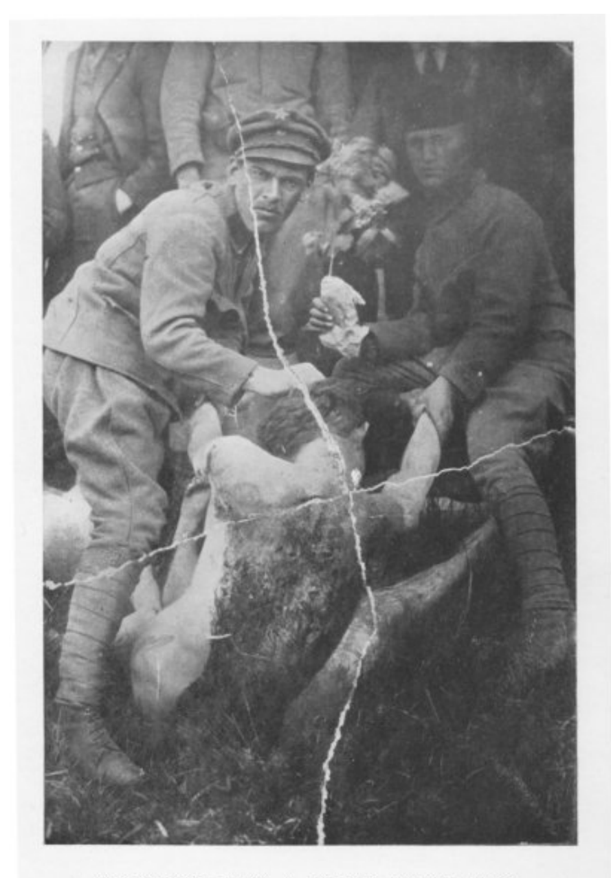
TERRORISTS WITH A VICTIM WHOM THEY HAVE FLAYED AND TORTURED TO DEATH. (This photograph was found at their headquarters.)