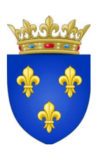
French Coats of Arms