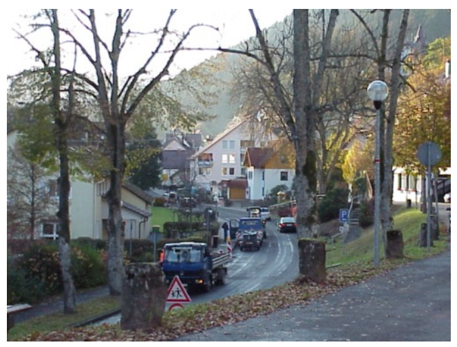
Bad Teinach - Black Forest - Germany

Please note that this is a translation from Ria's notes for a lecture given in German to an assembly of Christian brothers gathered in Bad Teinach on 30th October 2007, for a 5 day conference, the theme of which was The House of Judah and the House of Israel, and is not a verbatim word for word translation as given in the lecture.