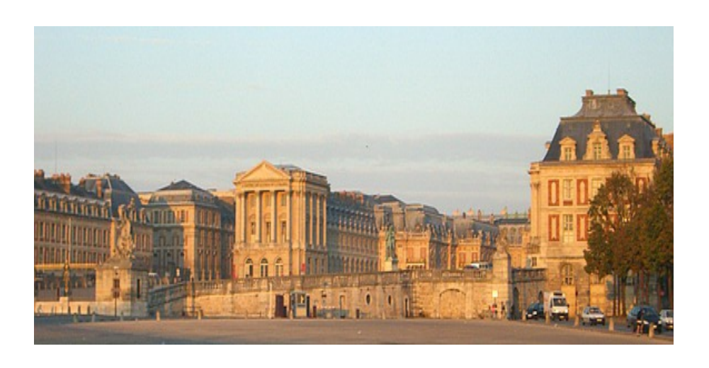
The Palace of Versailles

be fulfilled. Is 55:11 "So shall my word be that goeth forth out of my mouth: it shall not return unto me void, but it shall accomplish that which I please, and it shall prosper in the thing whereto I sent it". AMEN