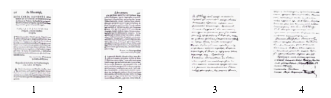
<u>Pict 1</u>. LA SILVA CURIOSA: Photostat of the letter from the Grand Satrap Constantinople to the Chief Rabbi of Spain in 1492, (UK- sixteenth century Spanish book by Julio-Iniguez (I'nis. Orry, I608).

power of the world. Thus proclaimed, at length came the stupid drivel intended to support this thesis and calculated to make the Jew repulsive in the eyes of his fellow-men and to exterminate him, not figuratively, but literally, appealing, as it does, to the lowest passions and proceeding upon the same processes that were employed in the Middle Ages for the same object. Then it was the blood accusation, the charge of poisoning wells, of spreading plagues and pestilence, of the desecration of the Host. Now it is pretended conspiracy to overturn the economic system of the world by inciting warfare and revolution.