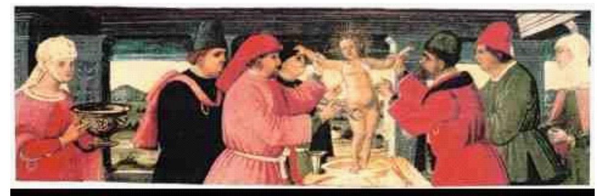
Simon of Trent