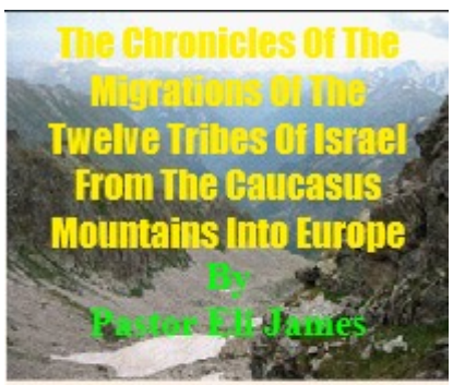
The above PowerPoint presentation is available at Pastor Eli's website: