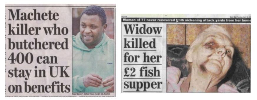
This is a direct result of allowing Zionists to rule Parliament

This anti-European propaganda is being absorbed by the naive younger generations. For centuries the Jewish manipulators created wars to further their own plans and then put the debt on to the people. While Europeans have been engaged in honest work the most sinister Jews have been scheming how to make profit from their toil. So wealthy have they become that through manipulating the stock market they now own most of the largest companies.