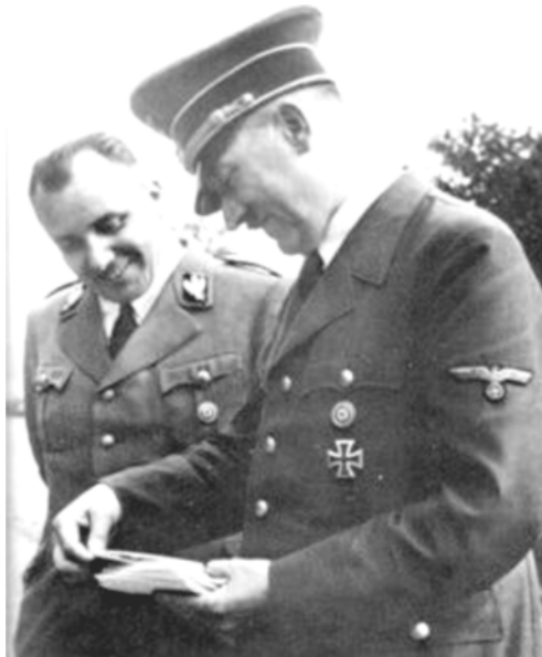
Martin Bormann and Hitler

The second most powerful man in Nazi Germany, Martin Bormann, Hitler’s Private Secretary and Head of the Nazi Party apparatus, was an Illuminati (((i.e. British))) agent who ensured the destruction of both Germany and European Jewry.