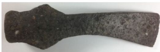
A warlike people: Khazar battle axe, c. 7th-9th centuries

Arabs have long cited the Khazar hypothesis in attempts to deny a Jewish historical claim to the land of Israel. During the UN debate over Palestine Partition, Chaim Weizmann responded , sarcastically: “It is very strange. All my life I have been a Jew, felt like a Jew, and I now learn that I am a Khazar.” In a more folksy vein, Prime Minister Golda Meir famously said: “Khazar, Schmarzar. There is no Khazar people. I knew no Khazars in Kiev. Or Milwaukee. Show me these Khazars of whom you speak.”