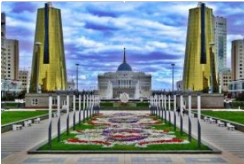
Capital of Kazakhstan called Astana - New Global Capital

The Khazars were a Mongol-Tatar people (see map below) who converted to Judaism en masse during a tumultuous time in Eastern European history. Surrounded on both sides by the warring religions – Christianity and Islam, the Khazar Empire choose the path of Judaic conversation as a means of stemming off invasion from either of its larger neighbours.