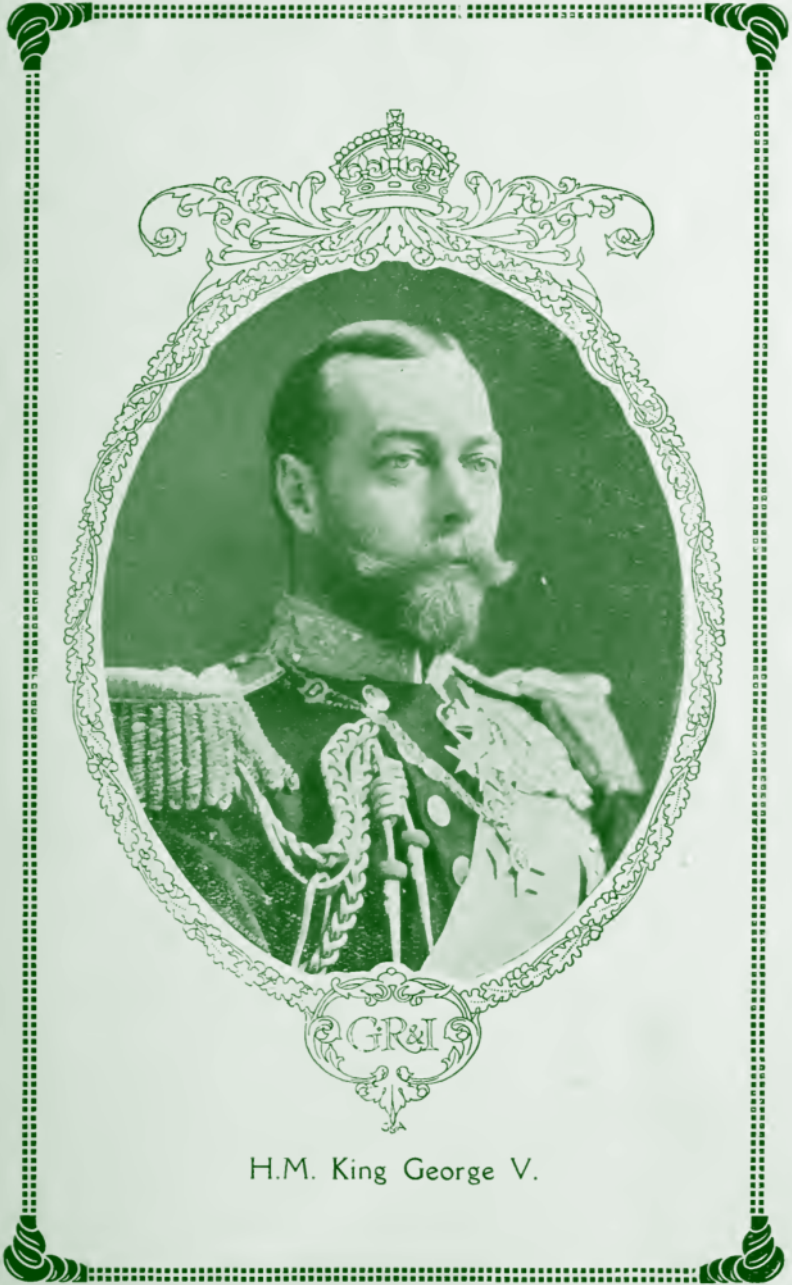
H.M. King George V.