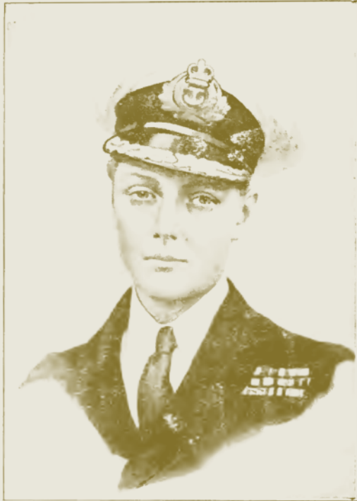
H.R.H. The Prince of Wales.