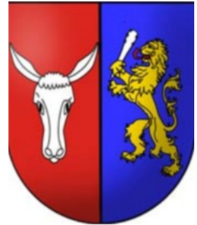
House of Jeski Silesia