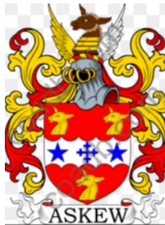
Askew Family England