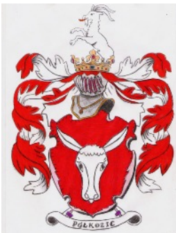
House of Polkozić Poland