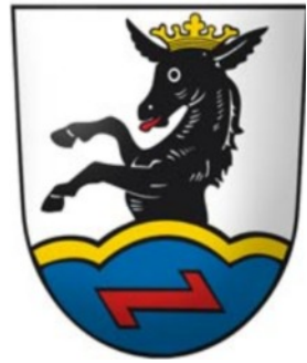
Tussenhausen Borough Germany