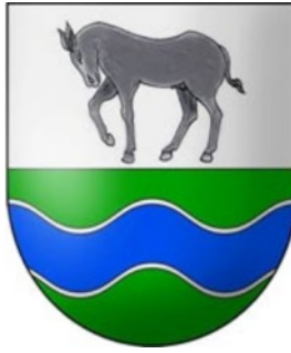
Usiln Borough Czech