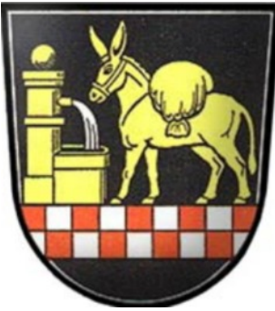
Maulbronn Borough Germany