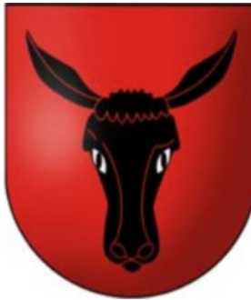
House of Maskiewicz Poland