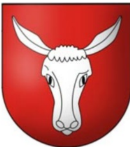
House of Machnicki Poland

Whole swathes of land have been tussled over for more than 1000 years between Germanic speaking and Slavic speaking Europe (Germanic dialects are English, Dutch, German, and Scandinavian. Slavic are Russian, Polish, Czech and so on). These areas are full of town and shire names in both German or Polish/Czech.