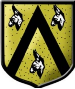
House of Haniel Germany