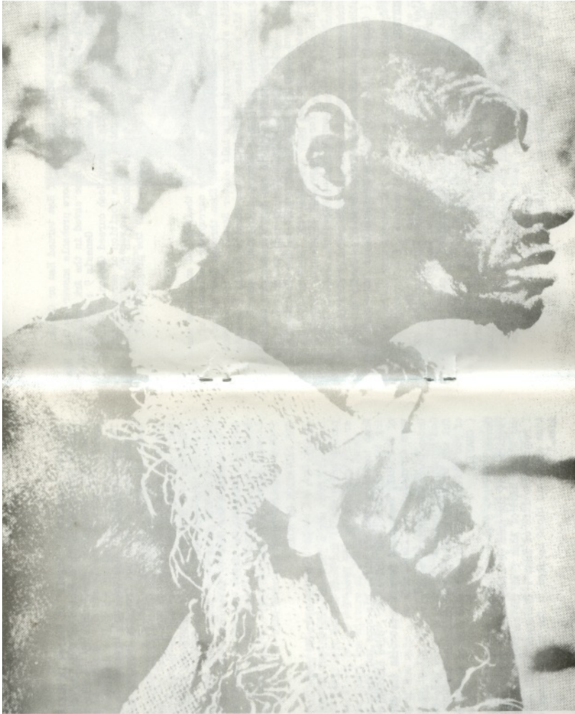
African Ape-Man Casts New Doubts