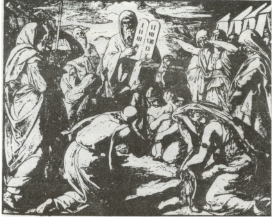
Moses presents the tablets of the Law to the children of Israel

Jeremiah 31:36:- “If those ordinances (the sun, the moon and the stars) depart from before me saith the Lord, then shall the seed of Israel also cease from being A NATION before me forever.” Therefore the Israelites must still be in the world today as a white nation. 1 Kings 8:51:- “For they be thy people and thine inheritance which thou broughtest forth out of Egypt, from the midst of the furnace of iron, that thine eyes may be open to see the supplication of thy servant and unto the supplication of thy people Israel ... for thou didst separate them from among all the people of the earth to be thine inheritances." Isaiah 19:25:- "Whom the Lord of Hosts shall bless saying, blessed be Israel mine inheritance. (See also the Book of Common Prayer which alien infidels are seeking to destroy: Matins and Evensong:- “O Lord save thy people: and bless thine Inheritance”).