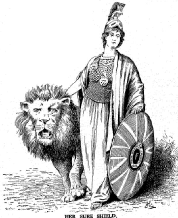
HER SURE SHIELD.