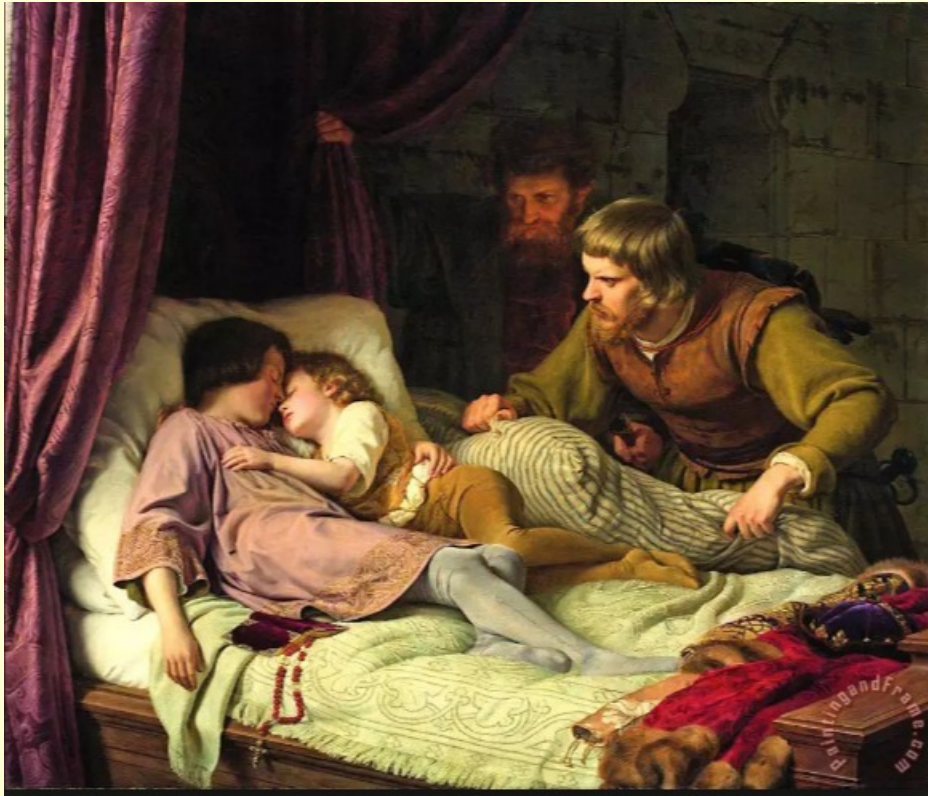
The Murder of The Sons of Edward IV