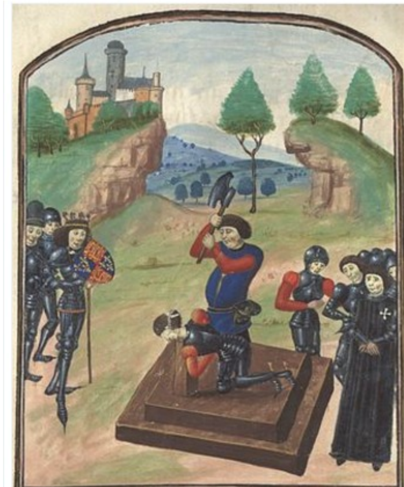
Illuminated miniature of Edward IV (left) watching the beheading of Edmund Beaufort, 4th Duke of Somerset at Tewkesbury, 1471

8) He was delivered to Edward by the Archbishop of York, who had made his peace with him.