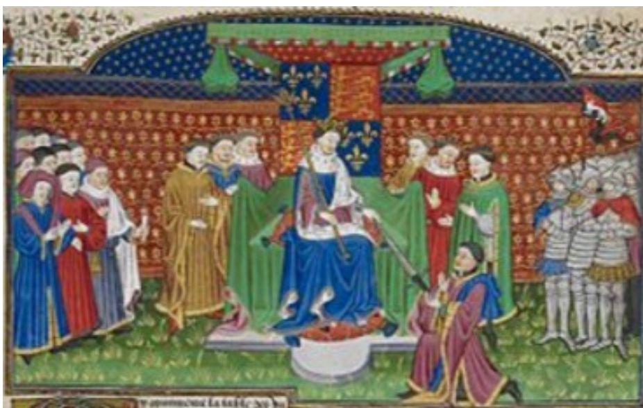
Depiction of Henry enthroned, from the Talbot Shrewsbury Book, 1444–45

48) On October 25. He came from the Tower dressed in a long gown of blue velvet, to St. Paul's church; attended by the Duke of Clarence, the Earls of Warwick and Shrewsbury, the Lord Stanley, &c. And from thence went to the Bishop of London's palace, where he kept his court.