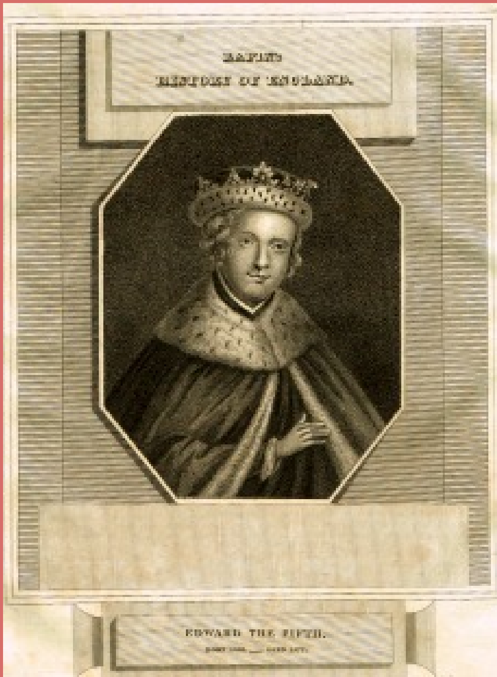
Edward The Fifth Born 1470 - Died 1483