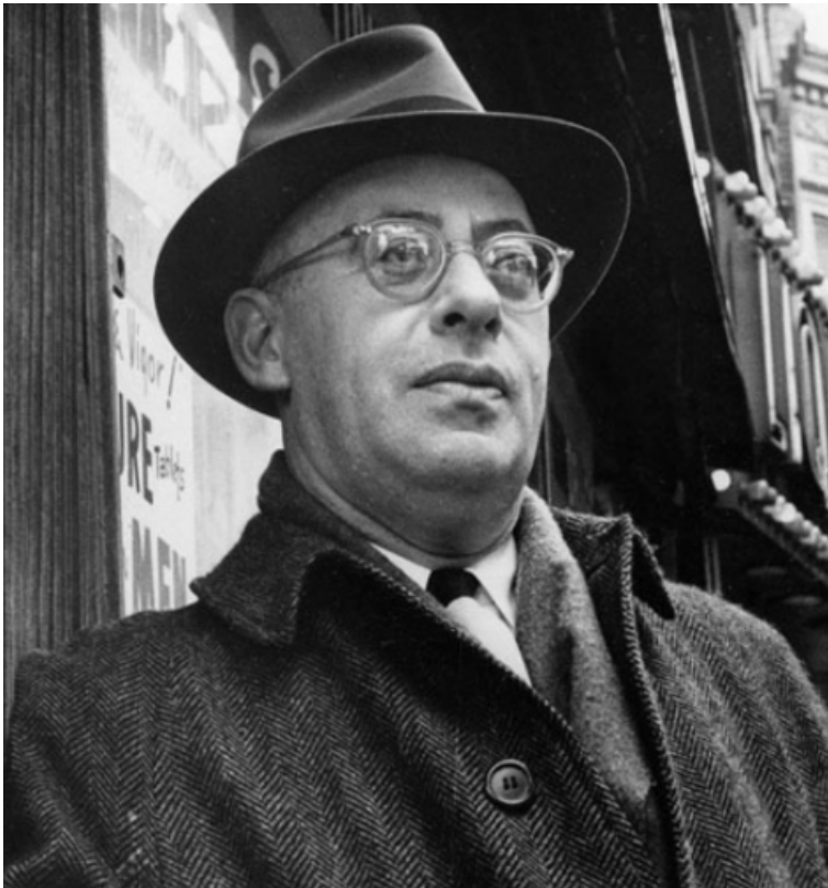
SAUL ALINSKY Trains Black revolutionists

“The bedrock for civil rights is nothing less than economic rights, school integration and the right to vote.”