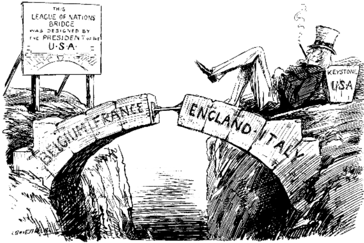
THE GAP IN THE BRIDGE.