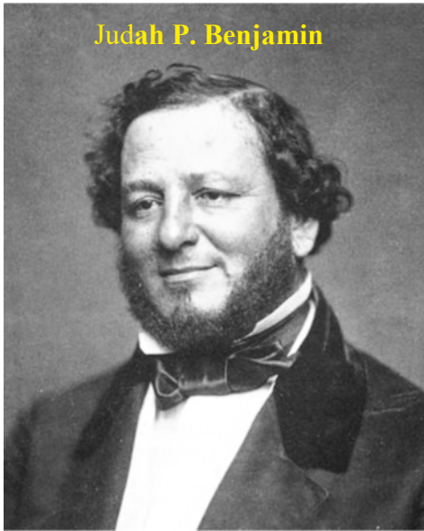
Judah P. Benjamin

messages, the key to which was in Judah F. Benjamin's possessions." Benjamin escaped to England where he died. These two prominent leaders are just two of the untold millions murdered by the Bankers in pursuit of their goal of World Government for themselves and slavery for the rest of mankind.