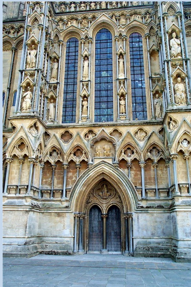
Entrance door Wells Cathedral - Somerset