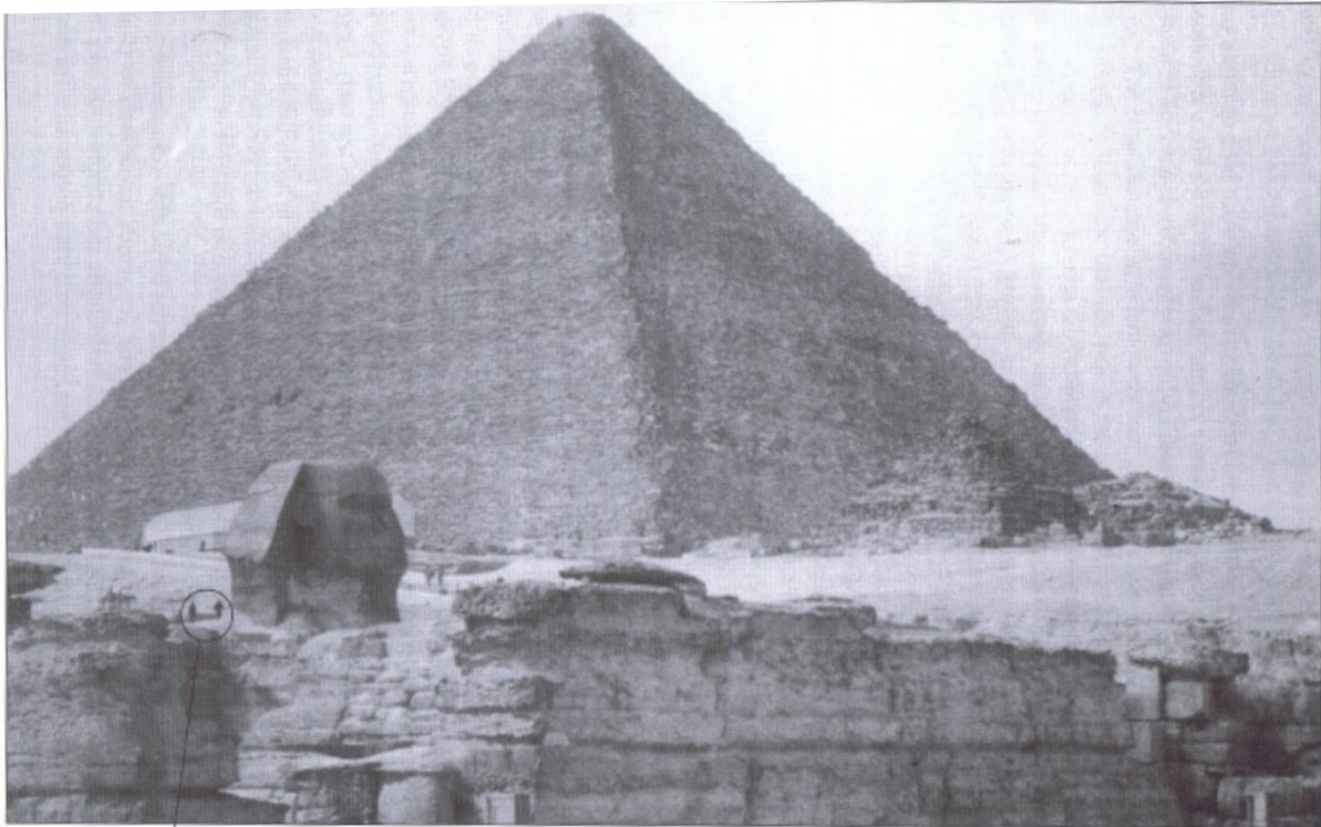
Encircled are two people to the left of the Sphinx, which serves to illustrate the enormous size of the Great Pyramid some distance away in the background

Both the Zodiac and the Great Pyramid contain the same central theme — that the Saviour (Messiah) would make His appearance in history to overcome evil forces, releasing mankind from the coils of lawlessness into a new freedom and a new understanding of the meaning of life with attendant endless benefits and fruitfulness. Each of these two witnesses emphasise and illuminate different parts of this story at different times in world history to different groups or families — though many of these families had a common ancestry. Consider, for example, the twelve Arab princes born to Abraham through his Egyptian wife Hagar, and their separate development from his other progeny through Sarah and Rebecca.