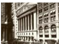
J. P. Morgan & Co. Offices

These techniques convinced the Rothschilds that they had found their man. They sent their personal representative, Jacob Schiff, to Cleveland to help Rockefeller (Rothafel) plan further expansion. At this time, the Rothschilds controlled 95% of all railroad mileage in the United States, through the J.P. Morgan Company and Kuhn Loeb Company, according to official Department of Commerce figures for the year 1895. J.P. Morgan mentions in his "Who's Who" listing that he controlled 50,000 miles of U.S. railways. Schiff worked out an elaborate rebate deal for Rockefeller, through a dummy corporation, South Improvement Company. These rebates ensured that no