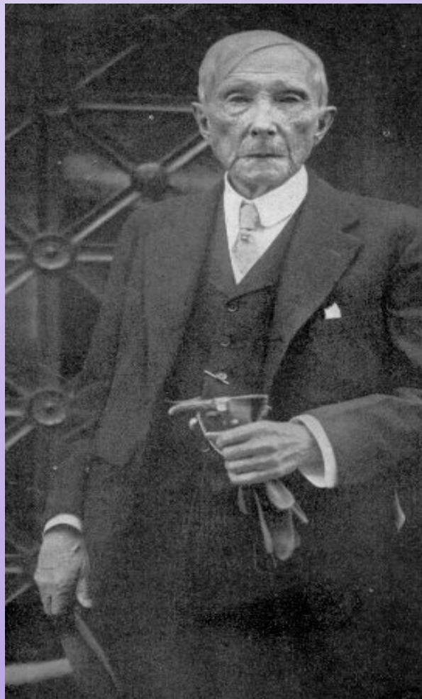
John Davidson Rockefeller