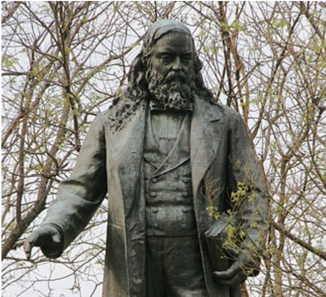
Brigadier General Albert Pike statue, Washington, D.C.

Entered according to Act of Congress, in the year 1871, by Albert Pike, In the Office of the Librarian of Congress, at Washington.