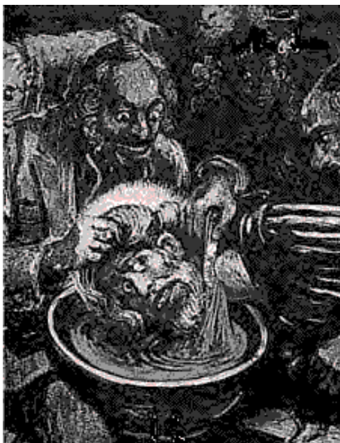
David Harari makes the first cut. . .

conjunction with the (for example) "Christian" meetings arranged in London were remitted, among others, to these very Talmud -schools!