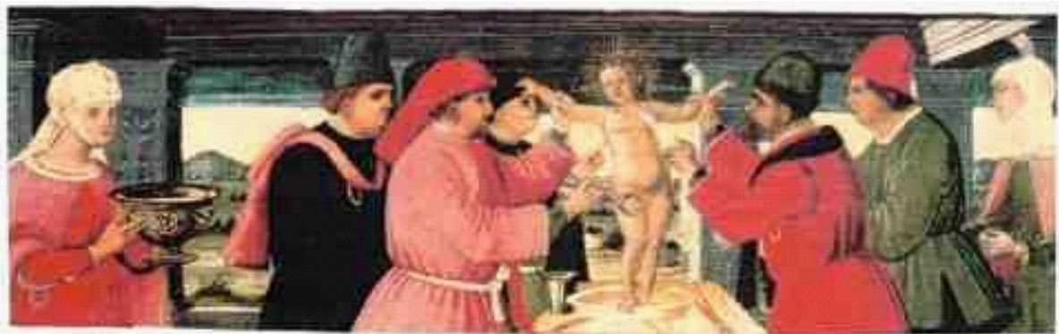
Simon of Trent