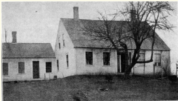
Ellen White's Birth place at Goram ME.