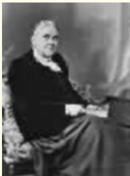
Ellen White - 1899