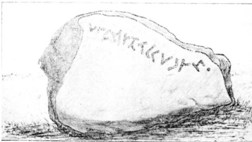
The Fletcher Stone with Runic inscriptions