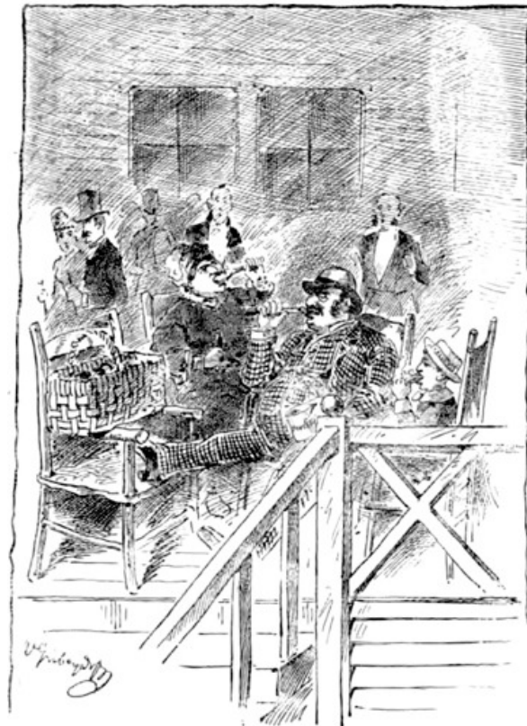
ON THE SUMMER-HOTEL VERANDA.

Pretty forcible! But, upon the whole, a very accurate description of the true state of affairs.