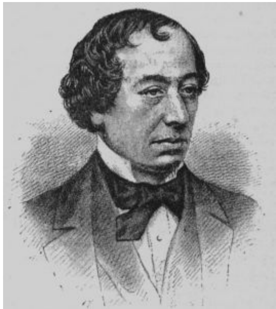
Jew Lord Beaconsfield

We have been accused of being Jew-baiters, of wishing " to create a revolution " against the Jews. This is not true. We despise only villainy, and our aim is to direct the attention of Americans to the danger that lurks in the Jew.