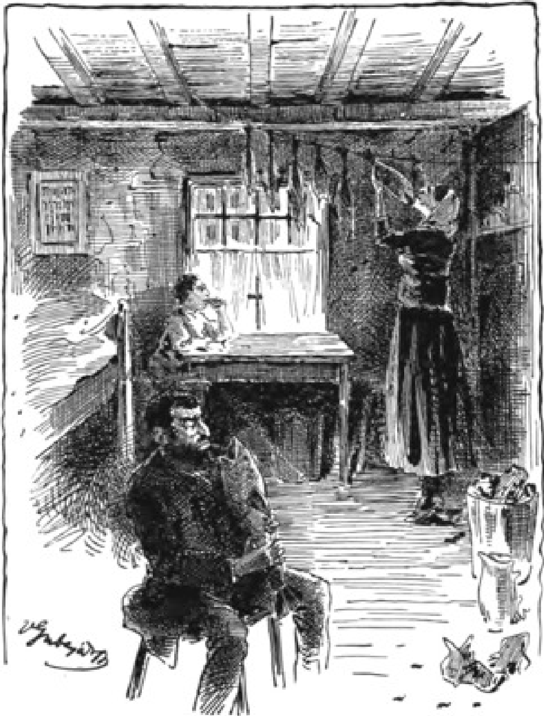
STORING THE STALE FISH OVER NIGHT.