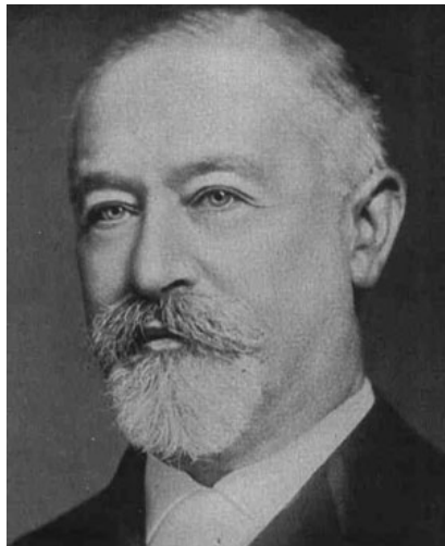
Jacob H. Schiff

If the Gentiles in this country would combine, and refuse to deal with the Jews, if Gentiles would refuse to buy any goods manufactured by Jewish firms, if American women would absolutely refuse to patronize Jewish stores, these blood-sucking Shylocks would speedily be relegated to their natural sphere of action, " the old-clo' " business, and underpaid womanhood would no longer be forced to the streets for subsistence. Remember, by encouraging the Jew in business you indirectly promote vice, degrade womanhood, and dwarf the business prosperity of the country.