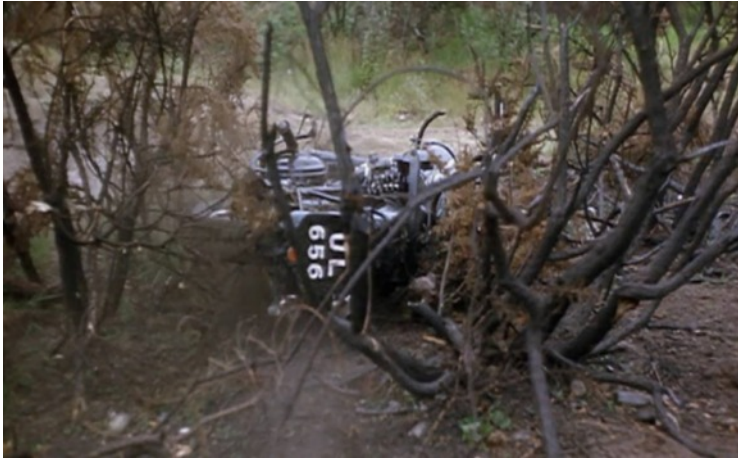
Above Lawrence's Crashed Motorbike and Below His Grave