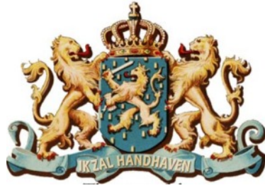
The Arms of The Kingdom of The Netherlands