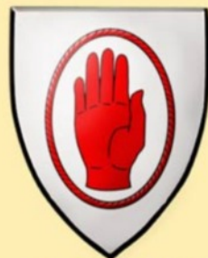
Secondary (Zerah-Judah) Genesis 38:28-30