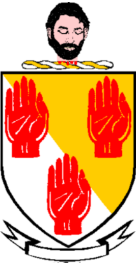
Adair Arms of Adair Ireland