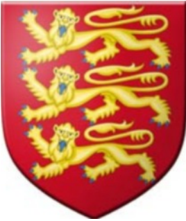
Arms of England