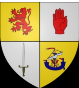
Left The MacBean Family Scotland