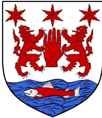
Arms of Neill - Ireland