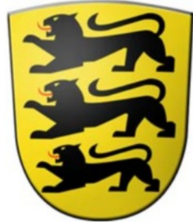
Arms of Baden- Wuttemberg