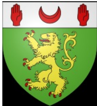
Arms of MacCartan