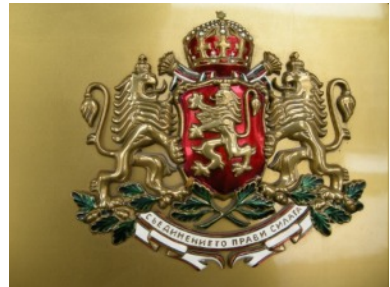
The Bulgarian Coat of Arms

Some heraldic authorities say that the golden lion represents Pharez Judah, while the red lion that of Zarah Judah