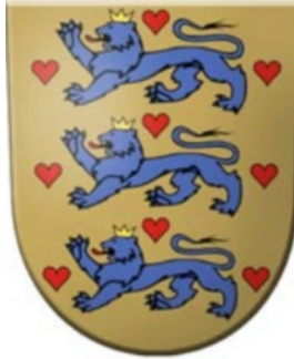
Arms of Denmark