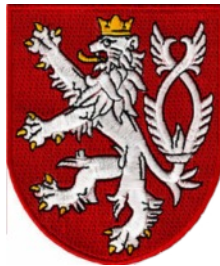
Czech of Arms