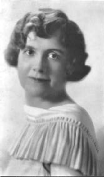
Mrs. Elizabeth Dilling

E LIZABETH DILLING was an American anti-communist and later anti-Jewish, anti-war campaigner and writer from 1932 to 1966. She was indicted by the Roosevelt Administration and charged with "sedition" in what was called the Great Sedition Trial of 1944.