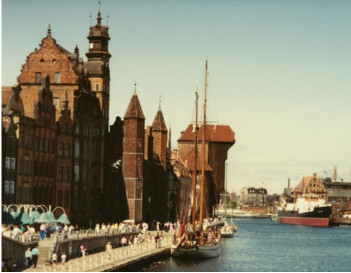
Danzig Old Harbour