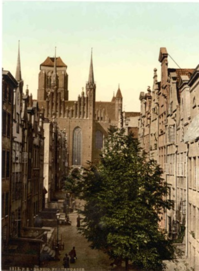
The Frauen Gasse - Danzig