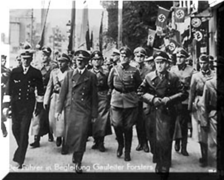
Hitler out for a stroll in Danzig.