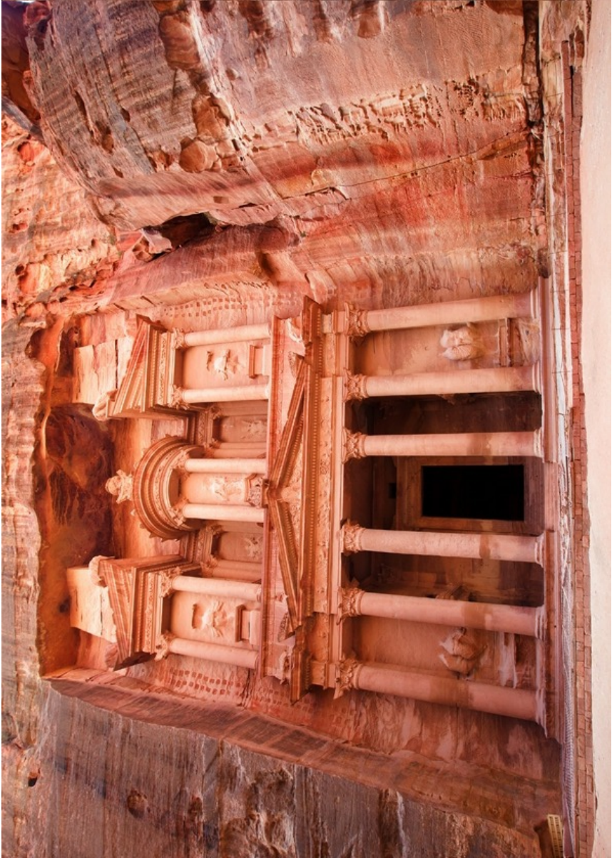
The Treasury Petra