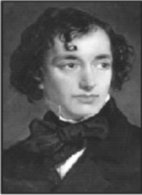
Benjamin Disraeli 1804-1881

Revealed that members of the same tribe had hijacked the motion picture, sport and entertainment business and controlled the American Media and were leading America to ruin: wrote "You don't need the League of Nations to end wars. Gather together the fifty most wealthy Jewish Financiers who create wars for their own profit - control them and you will put an end to it all". The International Jew .