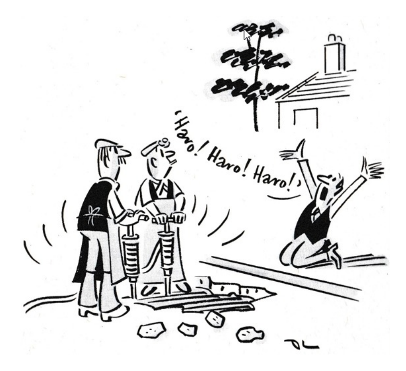
Clamouring For His Rights

There was once a man who considered that certain works being carried out near his house were interfering with his rights. Accordingly, in the presence of five witnesses, he fell on his knees and shouted: " Haro, haro, haro, à l'aide mon prince: on me fait tort. " (Haro, haro, haro, to my aid, my lord: I am being wronged!) He then recited the Lord's Prayer in French. The five men who were engaged in digging up the road near his house immediately stopped work and reported to their employers.