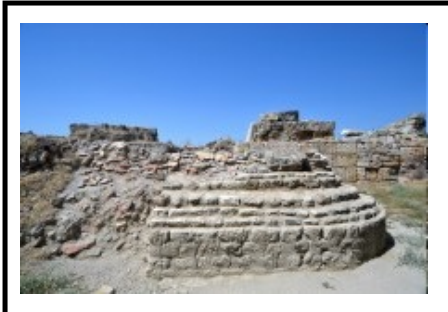
Central Baths in Laodicea on the Lycus 6