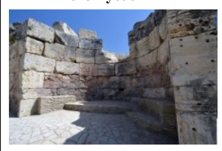
Central Baths in Laodicea on the Lycus 4