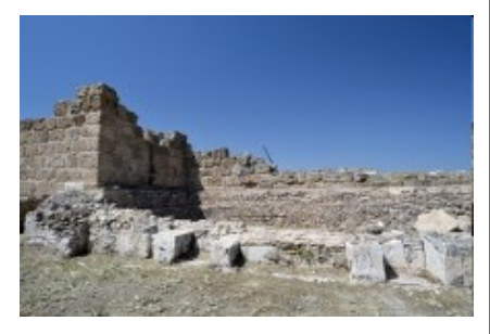
East Byzantine Nymphaeum in Laodicea on the Lycus