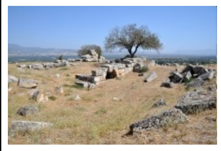
East Baths in Laodicea on the Lycus