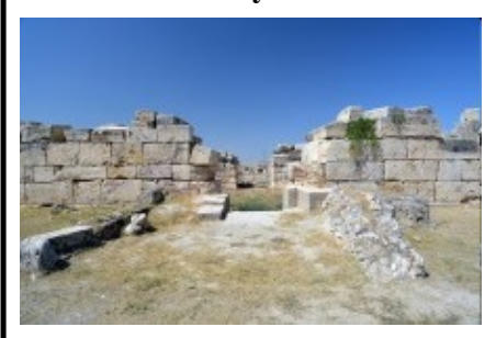
Central Baths in Laodicea on the Lycus 2