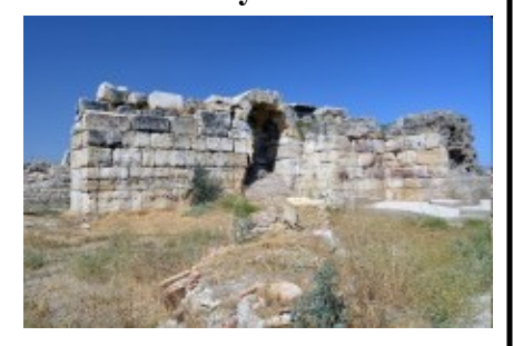
Central Baths in Laodicea on the Lycus 3