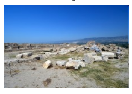
Corinthian Temple and North Basilica in Laodicea on the Lycus 2