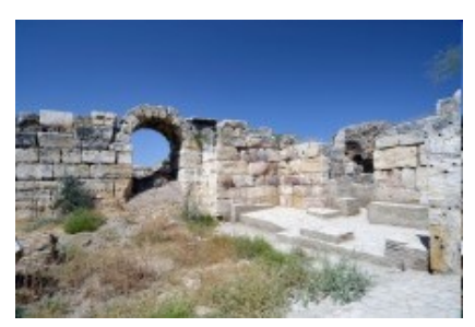
Central Baths in Laodicea on the Lycus 5