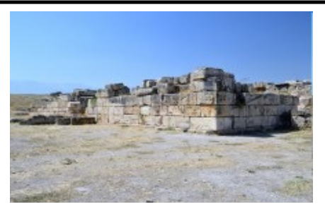
Central Baths in Laodicea on the Lycus