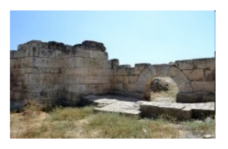
Central Baths in Laodicea on the Lycus 7