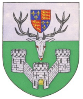
Royal New Windsor 1556