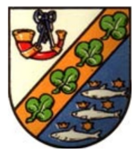
Shield of Dregterland Holland