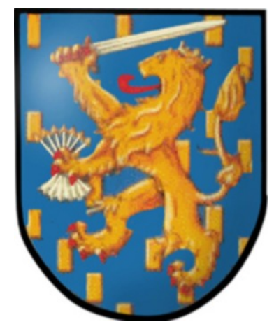
The Lion of Judah in the shield of the Royal Dutch coat of arms holding provincial arrows, a Manasseh symbol