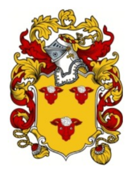
Bull Family England