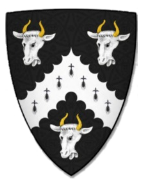
House of Norbury of Serridge and Droitwich