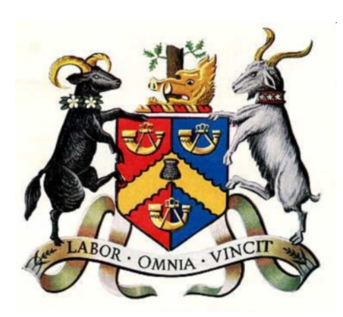
Bradford City England