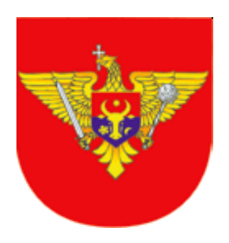
Arms of Moldova