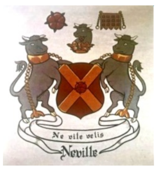
Neville Town Neville Island