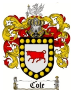
Cole Family England