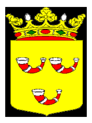
Haelen Municipality Holland