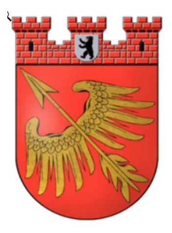
The Borough shield of WEDDING in Germany with Manasseh symbol