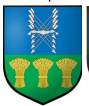
Shield of Sheffield