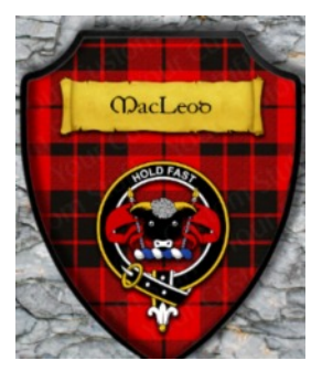
Clan MacLeod Scotland