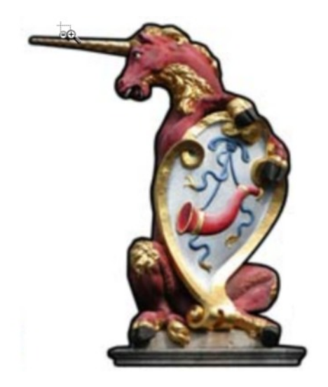
Sheild and Bearer Hoorn Holland