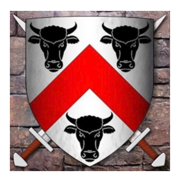
Boleyn Coat of Arms