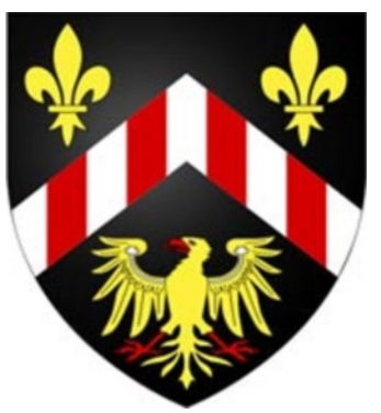
The Earl of Snowdon