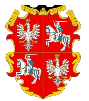
Polish Lithuanian Commonwealth