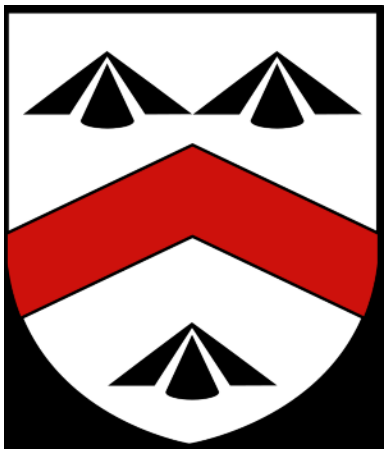
Arms of The Walsh Family