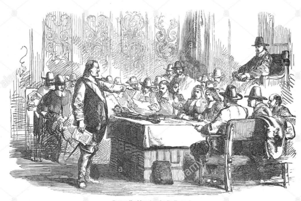
Cromwell addressing the Parliament.