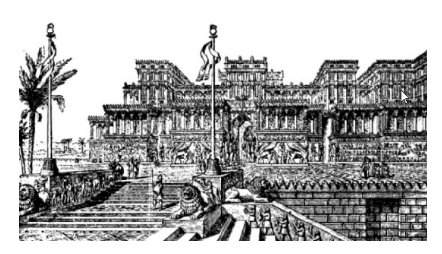
The Palace of Sennacherib

NOTHER INSTANCE SHOWING THE TRUTH OF THE BIBLE IN THE ORIENTAL INSTITUTE MUSEUM IN CHICAGO, ILL., is a clay Prism with Sennacheribs own account of his invasion of Judea and the taking of fortified cities of Judah where 200,150 people were taken captive as told in II Kings 18:17., and 19:35. The Palace of Sennacherib has also been found and about 100,000 volumes were recovered there. About 1/3 of this library is now in the British Museum. This library was found by Layard in 1849-50., and he says the