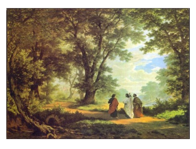
On The Road to Emmaus