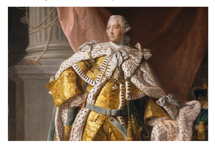
King George III

"To have the Declaration of Independence recognized internationally, Middle Templar King George III agreed in the Treaty of Paris of 1783 to establish the legal Crown entity of the incorporated United States, referred to internally as the Crown Temple States (Colonies). States spelled with a capital letter 'S,' denotes a legal entity of the Crown.