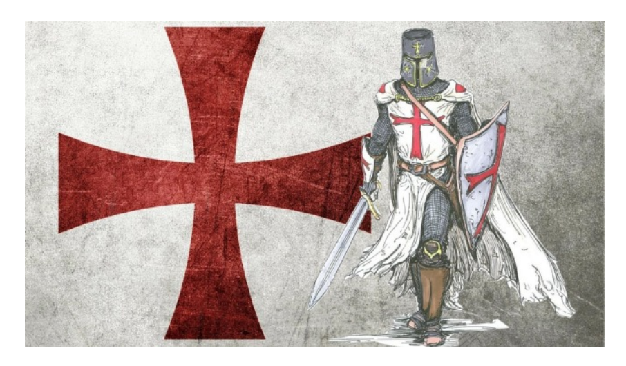
The Knights Templar

worn their allegiance by oath to the Middle Templar Bar. The Crown Bankers and their Middle Templar Attorneys rule America through unlawful contracts, unlawful taxes, and, contract documents of false equity through debt deceit, all strictly enforced by their completely unlawful, but 'legal,' Orders, Rules and Codes of the Crown Temple Courts Our so-called 'judiciary' in America. This is because the Crown Temple holds the land titles and estate deeds to all of North America."