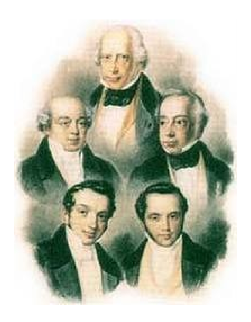
The 5 Sons of Mayer Bauer (Rothschild)

As we shall continue to explore, all resources are centrally collected, and they pass up to the top from the "less fortunate" to the elect of Zion, to the evil financial rulers of this world, and up to their master, the false god of this world.