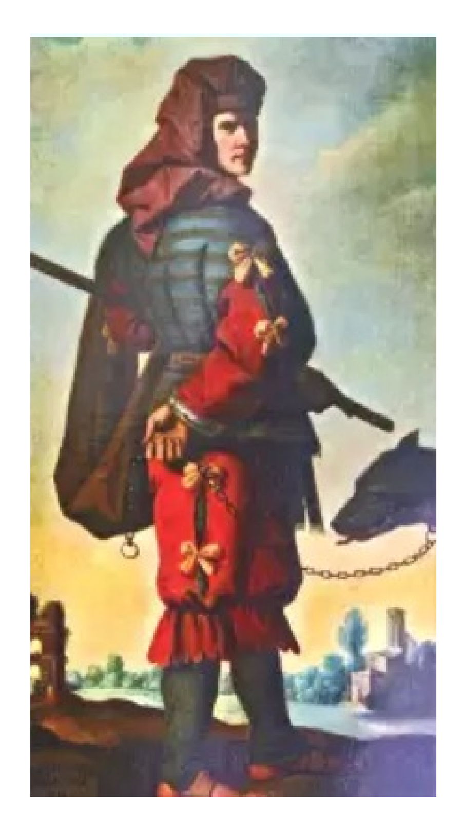
Benjamin - Zurbaran Painting at Auckland Castle