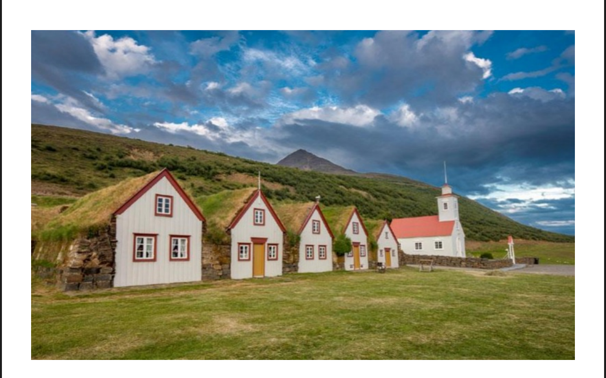
Turf houses, North Iceland