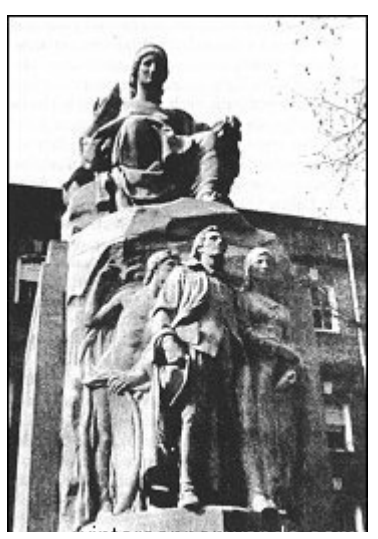
Monument to the German immigrants, erected in 1920 in Germantown.

ment of Milwaukee as a diocesan town, Wisconsin also becomes particularly attractive to Catholics. With its breweries, beer gardens, theater groups, athletics and choral societies it was considered the most typically German city in America.