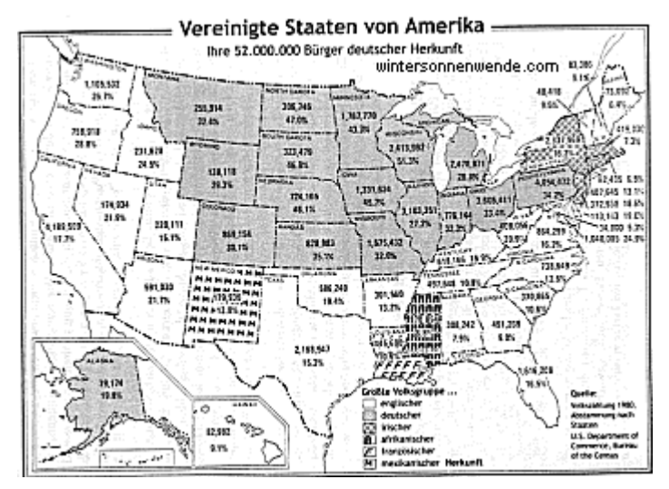
The United States of America and its 52,000,000 citizens of German extraction.

But it is in the field of music that the German-Americans gained by far their greatest influence. The artistic mastery of German musicians became the cornerstone for the founding of numerous choirs and orchestras. This musical creativity first had to prevail against the hysterical doctrine of Puritanism, which even banned music - but then the annual Bach Festivals in Pennsylvania became a musical event that put the entire nation under its spell.