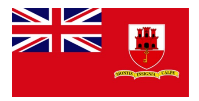
The Civil Flag of Gibraltar